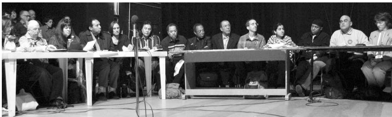
WBAI's elected board makes its debut (partial view).