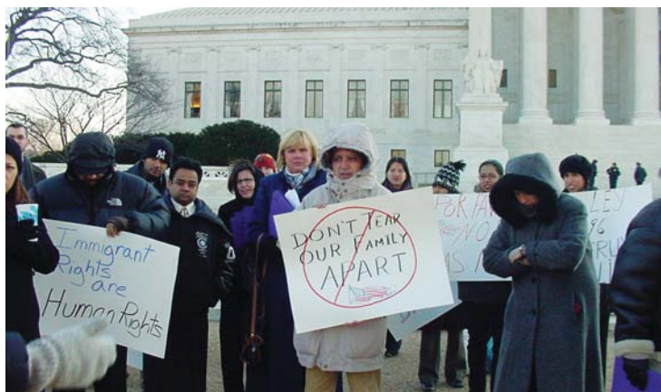
Protest by Families for Freedom at U.S. Supreme Court as it considers mandatory detention case.

For more on Jon Cohen's life, go to www.wbai.org (right column)